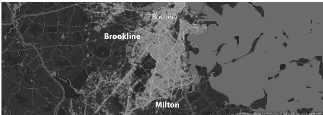
Stop and frisk incidences are concentrated in affluent white communities.

“The Boston Police Department just doesn’t care about white people,” said supermodel and Brookline resident Gisele Bundchen, also on her way out of SoulCycle. “Last week when my husband was frisked, they even searched inside his UGGS.”